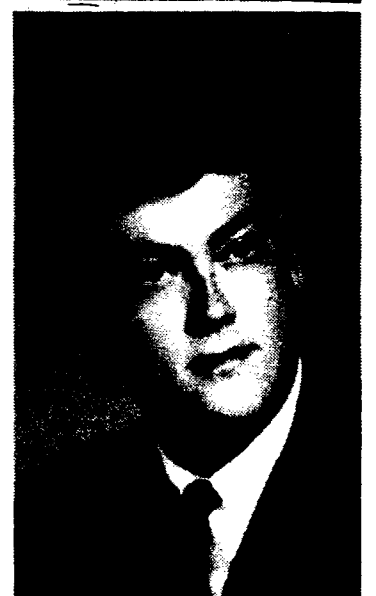
BIGSBY Gung ho for education action

Social barriers, too, will be subject to student attack.