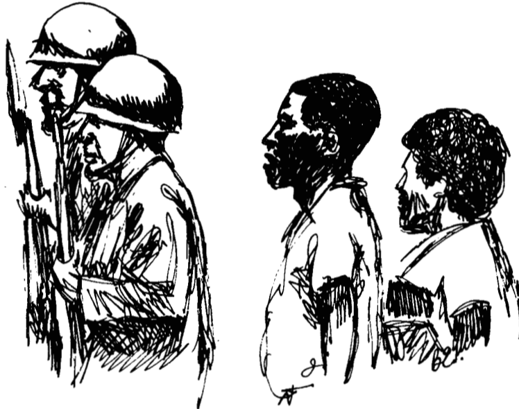
"For nearly a year, the paratroopers guarded the Little Rock nine."