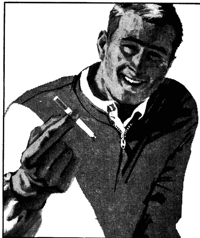
The Player's Jacket—fashioned by BANTAMAC in Terylene*, a Cel-Cel fibre. *Reg'd. Can. T.M.

Come on over to smoothness with no letdown in taste