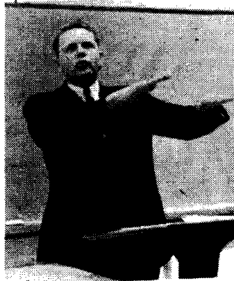
JOHN TURNER

Government control of education could occur in the foreseeable future if the government was covering all of the costs of the university he said Tuesday in an address to students at the University of Victoria.